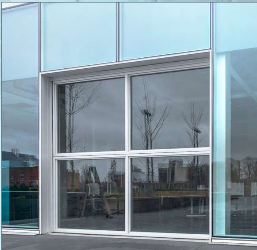
Cover Image: Arc3D™ Duo, installed, door in partially open position